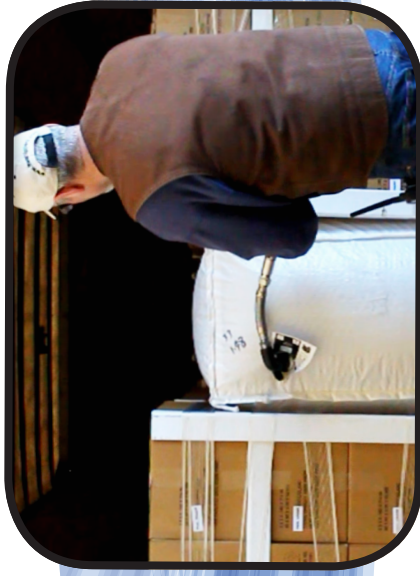
Inflates in approximately 1 minute