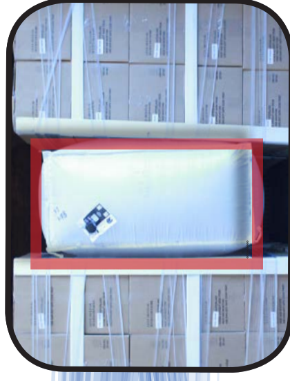
Covers more surface area